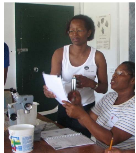
Teachers review lessons on coastal ecology at BREEF's summer workshop 2006

BREEF's mission is to educate the public about our underwater environment and how to protect it. Teachers are encouraged to contact BREEF for assistance with lesson ideas, field trips, and guest lectures. This year the annual teacher training workshop will be held from July 15-22 at the Gerace Research Center on San Salvador. Visit www.breef.org for great resources including information on the Nassau grouper closed season which runs from December 1, 2006 to February 28, 2007 . BREEF is located at Cave's Village, West Bay St: Tel 327-9000.